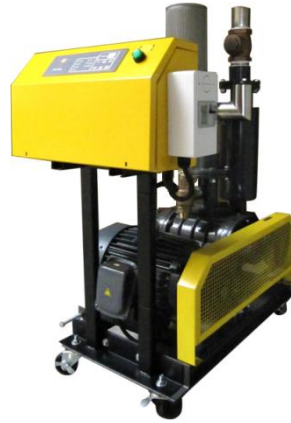
KCL -R SERIES